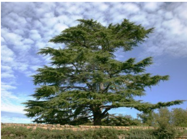
Cedar of Lebanon could be as high as 130 ft.

The word arrogance can be described as lofty attitudes and opinions lifted up and high. Notice how scripture uses trees as symbols of arrogance.