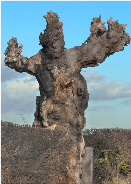
A tree that looks like a man.