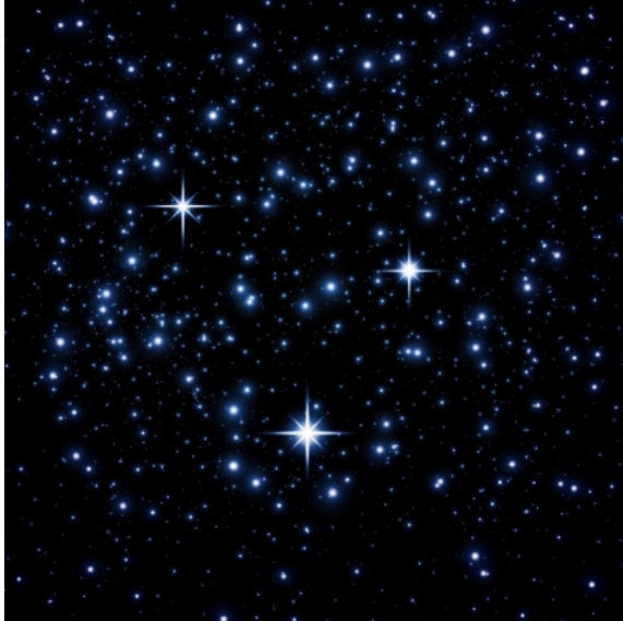
The prayers and fastings of the 144,000 are symbolized as stars.

lived their lives like Jesus, they will find peace in their hearts even though hell's armies are attacking them with accusations.